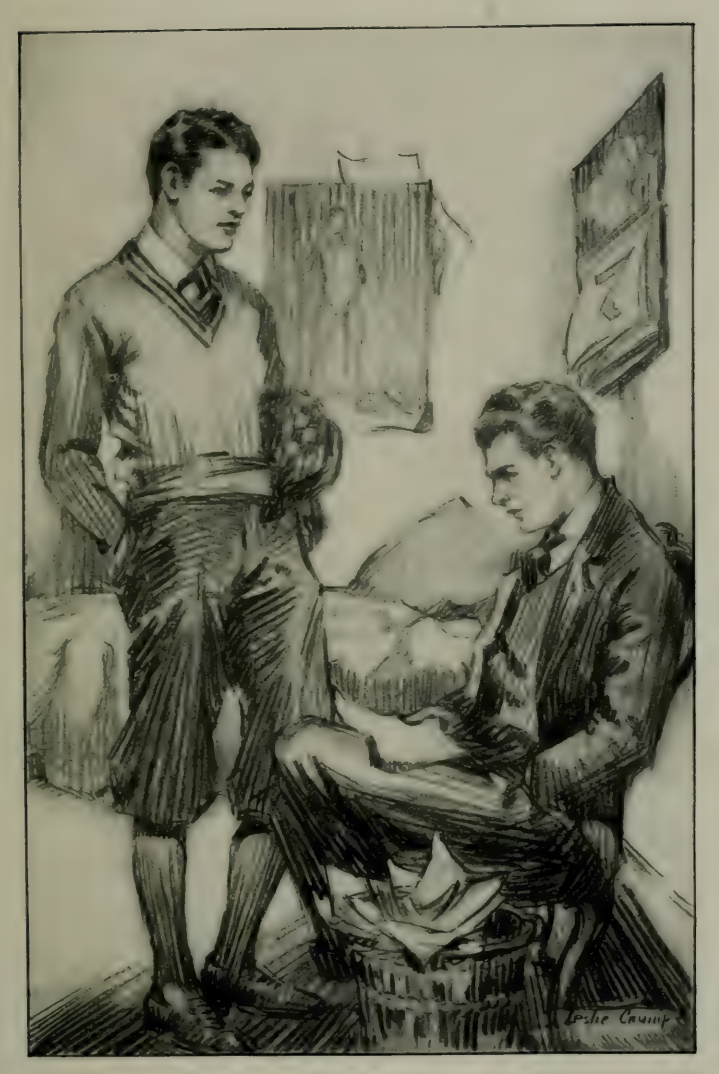
"This is no time to get cold feet"